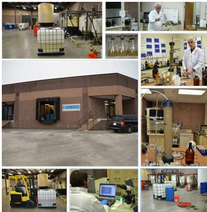
Photo: Terra Systems Manufacturing Plant and Treatability Lab