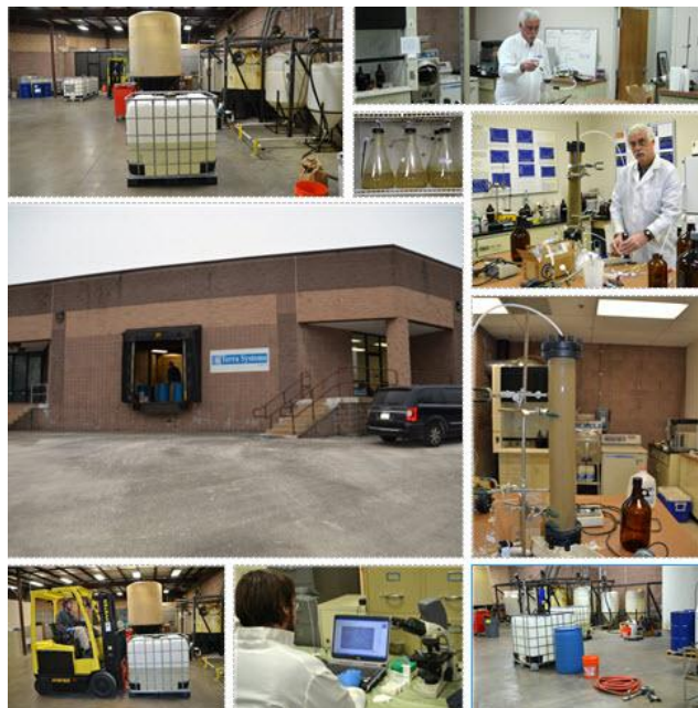
Photo: Terra Systems Manufacturing Plant and Treatability Lab